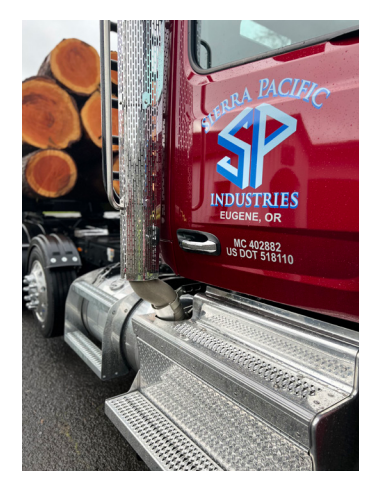
New Oregon Log Truck on display at the Oregon Logging Conference in February

The Oregon Trucking Division will serve the Eugene and Noti Divisions, as well as other facilities providing expanded driver and diesel mechanic opportunities. The new trucking fleet will include 15 log trucks and four lumber trucks. Having a localized transportation fleet provides valuable jobs and supports the relationships we maintain with our local contractors and customers.