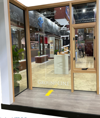
TimberLITE 2.0 with GroundLINE

On display – our trademark high-performance windows and specialty doors, a pivot door that turned more than a few heads, and a structural wonder called TimberLITE 2.0 that will be coming to market later this year. Did we mention it offers a feature that allows the glass to go straight into the floor!? This innovative engineering wonder called GroundLINE is a thing of architectural dreams.