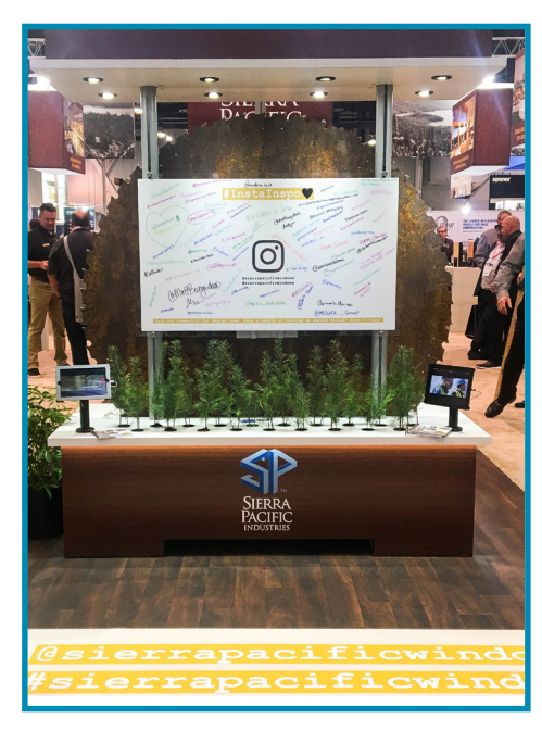
The focal piece of our IBS booth highlighting: 6 foot chop saw blade, seedlings and Instagram community board.

With high attendee numbers and strong leads captured, the show turned out to be another successful year for the Window's Division at the International Builders' Show. Orlando 2021 is up next.