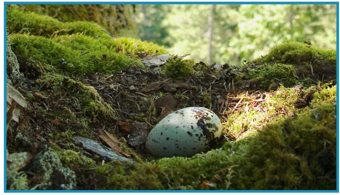
The marbled murrelet egg on a mossy branch. Though the bird is the size of a robin, its egg the size of chicken egg.

SPI's Washington State forestry team reached a historic milestone with the February approval of a wildlife conservation plan by the U.S. Fish & Wildlife Service. The Safe Harbor Agreement (SHA) for the marbled murrelet, developed under the federal Endangered Species Act, is a 35-year plan to conserve habitat for this threatened species. This agreement reflects a shared understanding between SPI and the USFWS that conserving wildlife habitat and sustainably managing forests goes hand-in-hand.