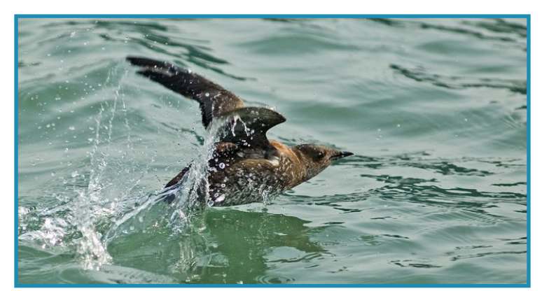
A marbled murrelet in breeding plumage taking off from the water.