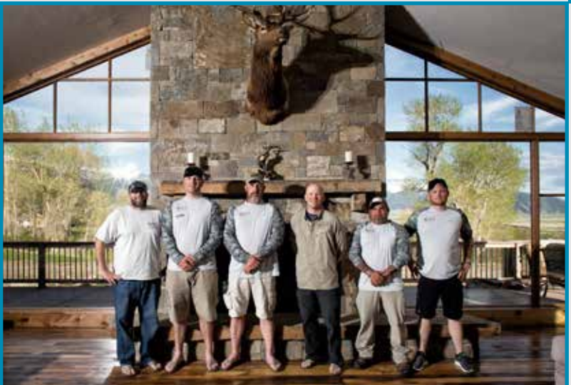
Post 9/11 combat veterans are continuing to heal at Quiet Waters Ranch

With the overwhelming numbers of seen and unseen injuries arising from over a decade of war, there will be a long-term continuing need for therapeutic recreation and alternative healing. Combat-related post traumatic stress and depression sometimes