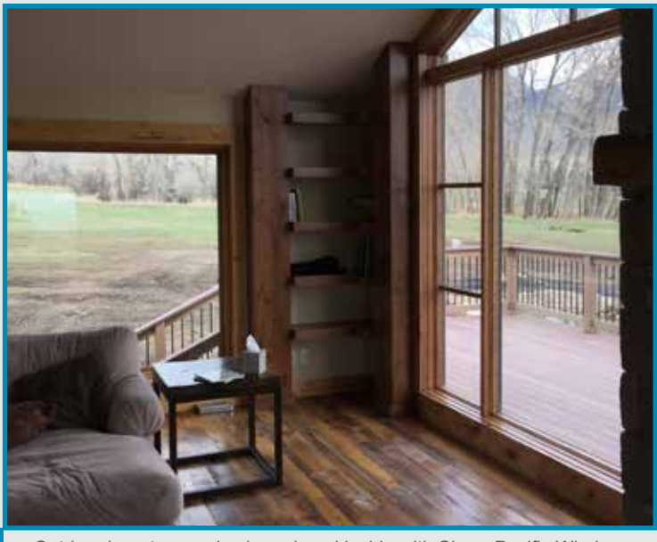
Outdoor beauty can also be enjoyed inside with Sierra Pacific Windows

takes years to set in. Amputations don't grow back. Disabilities are present for life.