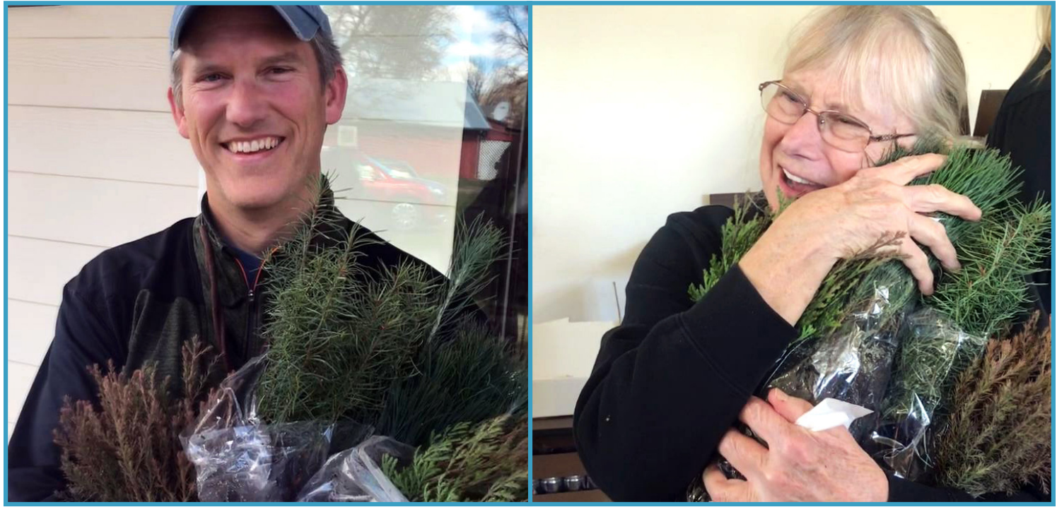
Grateful residents accept Sierra Pacific Industries seedlings at an event organized by French Gulch Upper Clear Creek Resource Management Group in April 2019.

For this planting season, Sierra Pacific Industries was honored to distribute 12,000 seedlings to northern California residents impacted by recent fires. Incense cedar, sequoia, sugar pine, and douglas fir were handed out at community events organized by regional partners focused on North State fire recovery and watershed restoration projects. Each seedling represents hope and restoration for these residents and their communities.