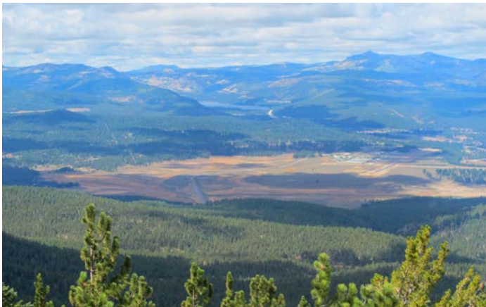
Martis Valley from Martis Peak

TRUCKEE, California -- A unique partnership of local landowners, Martis Valley developers, and Sierra conservationists today unveiled an extraordinary initiative to permanently preserve highly coveted open space in the heart of North Lake Tahoe's Martis Valley.